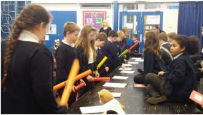
Enjoying live music this morning in assembly, including boom whackers and piano.