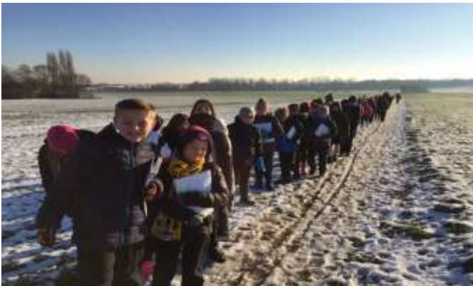
Enjoying the beauty of a winter walk in Year 5.