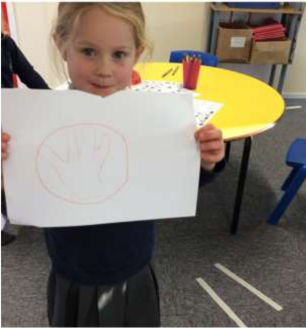
Some of us decided to measure other parts of our bodies, such as our hand!

Today we used the laptops for the first time. The children are whizzes on the ipads so we thought they were up for a new technology challenge. We learnt how to log in by pressing 3 buttons at the same time (ctrl, alt, del)