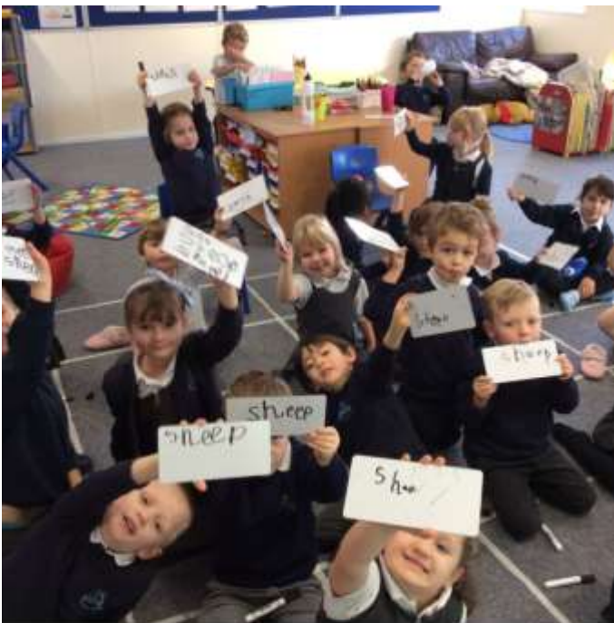
Class 2 have been learning digraphs and today we learnt 'ee'. We all had a go at putting it with another digraph and we made the word 'sheep'.

Year 3 and 4 visited Bar Hill Church to develop our understanding of Christian beliefs and the Christmas story.